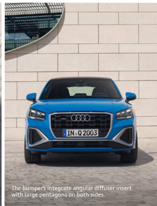
The bumpers integrate angular diffuser insert with large pentagons on both sides.