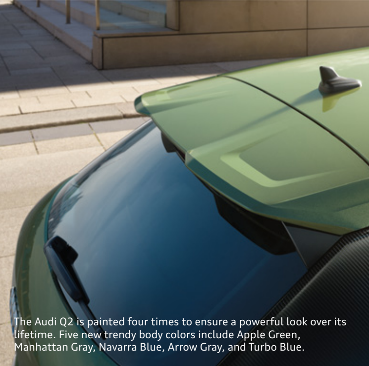
The Audi Q2 is painted four times to ensure a powerful look over its lifetime. Five new trendy body colors include Apple Green, Manhattan Gray, Navarra Blue, Arrow Gray, and Turbo Blue.