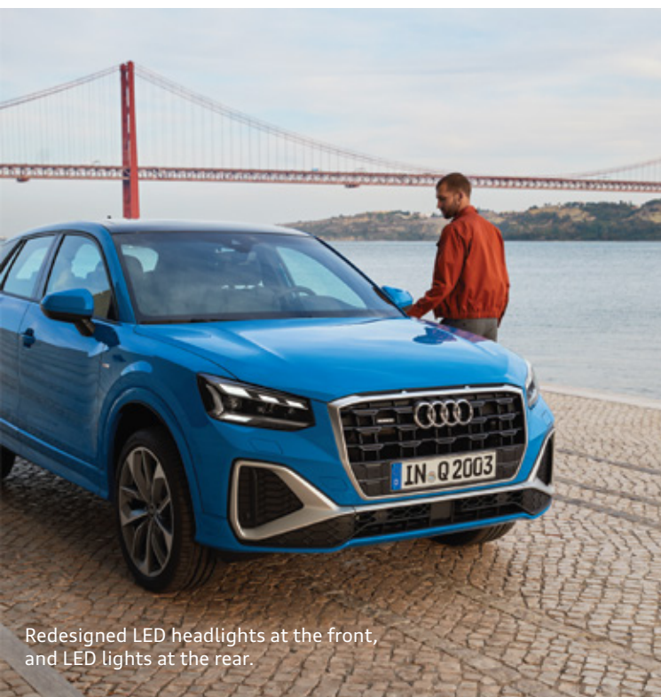
Redesigned LED headlights at the front, and LED lights at the rear.