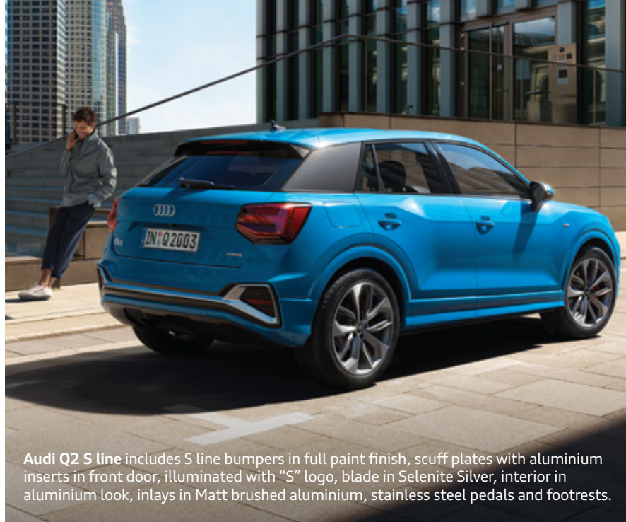
Audi Q2 S line includes S line bumpers in full paint finish, scuff plates with aluminium inserts in front door, illuminated with "S" logo, blade in Selenite Silver, interior in aluminium look, inlays in Matt brushed aluminium, stainless steel pedals and footrests.