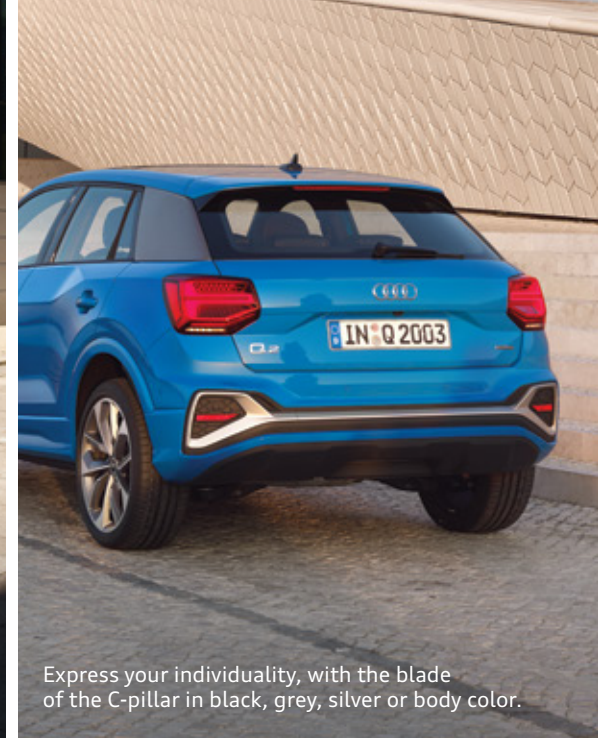
Express your individuality, with the blade of the C-pillar in black, grey, silver or body color.